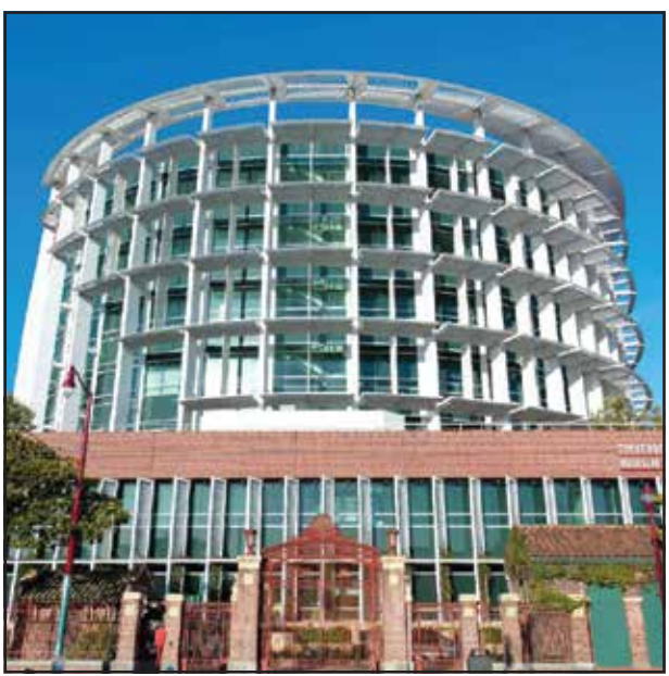
Zuckerberg San Francisco General Hospital and Trauma Center Fong & Chan Architects INvision™ Unitized Curtainwall