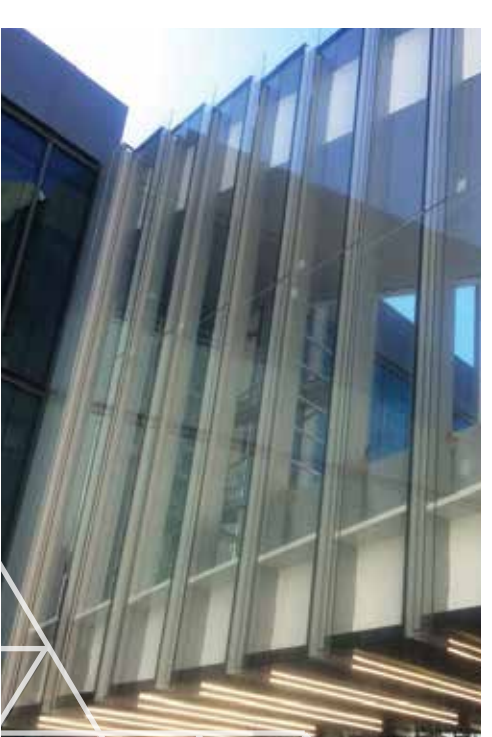
Twitter Skybridge Bohlin Cywinski Jackson Custom Unitized Curtainwall