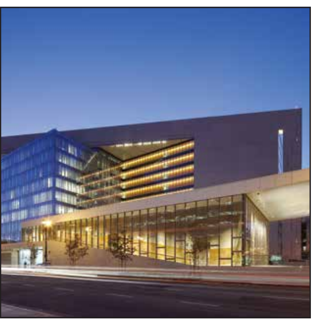
Los Angeles Police Department Headquarters AECOM INvision™ Unitized Curtainwall SuperWall™ and ClearStory™ Sun Shades