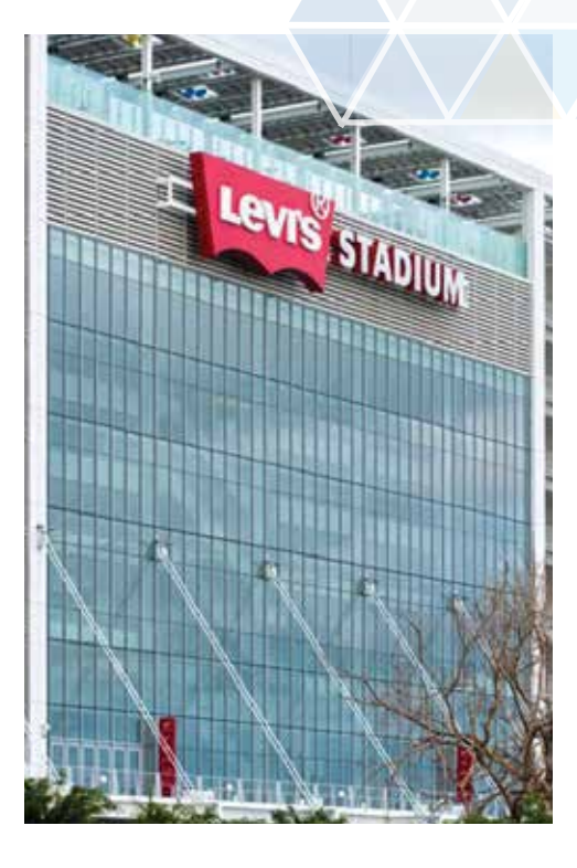
Levi's <sup>®</sup> Stadium HNTB Corporation INvision™ Unitized Curtainwall and Motorized Insert Vents