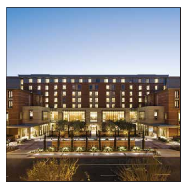
University of California Los Angeles Luskin Hall Hornberger + Worstell and Bohlin Cywinski Jackson INvent™ Windows, Insert Vents, SuperWall™, and Terrace Doors