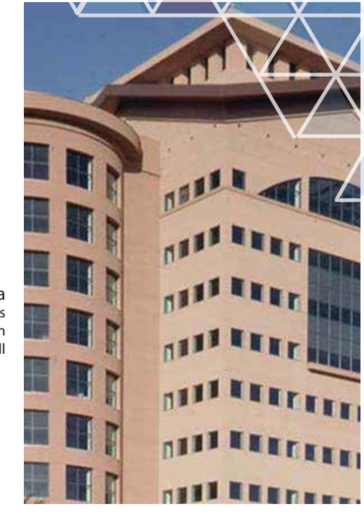
Aventine La Jolla Michael Graves Architecture & Design Custom Window Wall