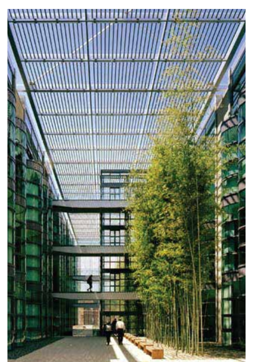
Stanford University Center for Clinical Sciences Research Foster + Partners Custom Radius-in-Plan Horizontal Rolling Windows and Aluminum Trellis