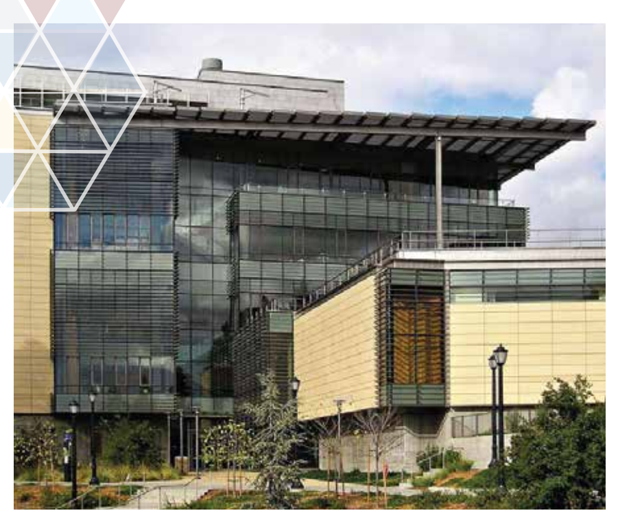
Li Ka Shing Center for Biomedical and Health Sciences ZGF Architects INvision™ Unitized Curtainwall, 4250 Offset Windows, and Insert Vents