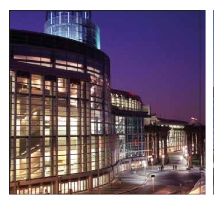
Anaheim Convention Center HOK Group, Inc. Custom Unitized Curtainwall and Aluminum Panels